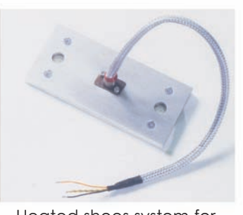
Heated shoes system for "speed up production"